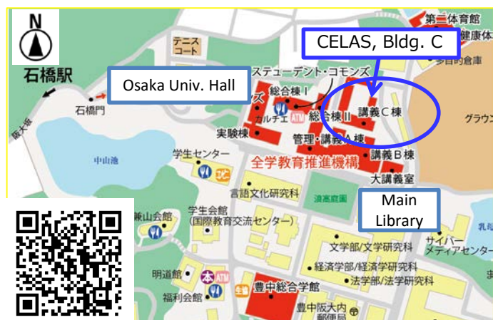
Toyonaka Campus Map