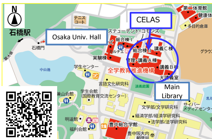
Toyonaka Campus Map